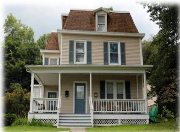
Putnam Supported Housing

We continue to pursue various structural and aesthetic improvements to this property with the knowledge it will serve our needs for many years to come.