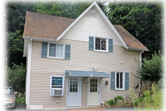
Vocational Rehabilitation Program